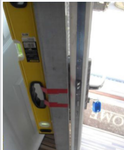
Straight edge on concave face