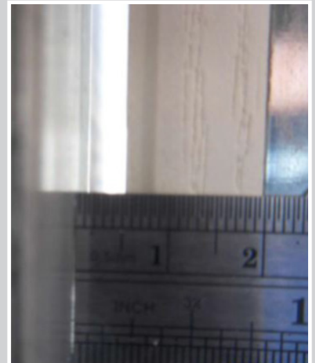
Measurement between door & straight edge

Please Note; it is recommended that fabricators pass this information to their customers. This is to ensure that they do not invalidate the warranty by poor installations that will affect the performance of the door-set once installed.