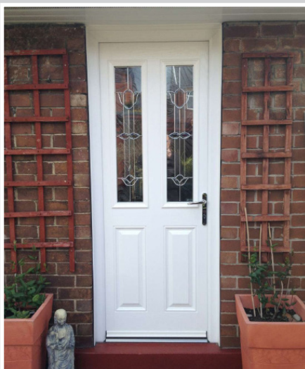
Full external face

Three images similar to the below must be supplied per reported door blank.